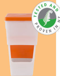
Kilmore bait station