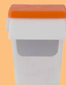
Sentry bait station